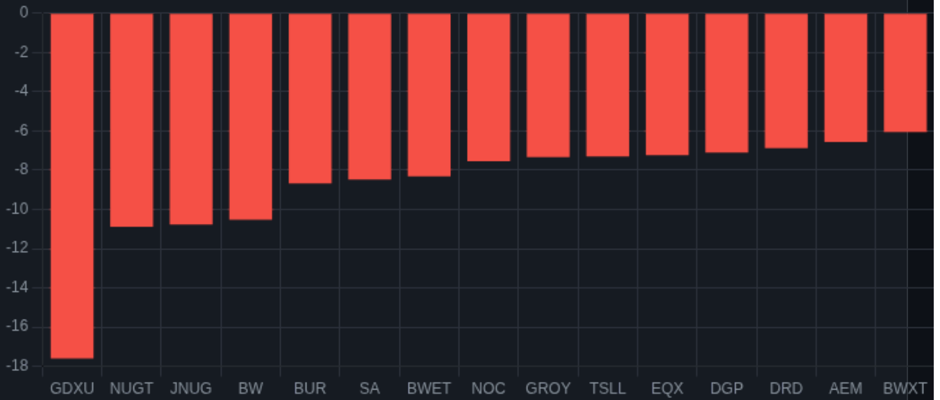
Bottom 15 WTD %