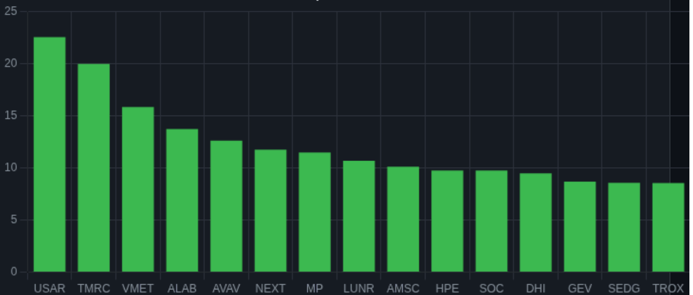
Top 15 WTD %